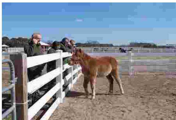
Nine month old Corolla's Grace meets some NPS Staff

CWHF and the National Park Service are cooperating in an effort that will bring the ponies on Ocracoke Island back to a more genetic and physical representation of the Banker Colonial Spanish Mustang. As soon as the details are final, CWHF will be loaning the NPS a wild stallion from Corolla.