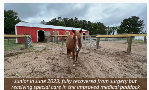
Junior in June 2023, fully recovered from surgery but receiving special care in the improved medical paddock