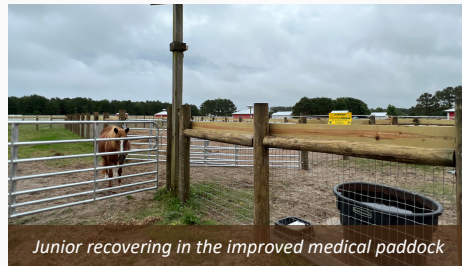
Junior recovering in the improved medical paddock