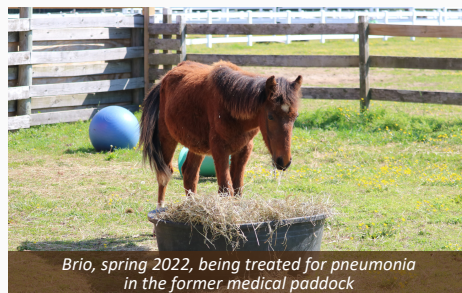
Brio, spring 2022, being treated for pneumonia in the former medical paddock

At the beginning of the year we identified areas around our rescue farm that would benefit from new and/or updated fencing. Based on current priorities and needs, we decided to start with building additional paddocks off the back of the barn. This provided us with more space for horse intake, quarantine, and medical care. We now have seven paddocks that are all interconnected but can also be closed off, along with an alley down the middle that will allow us to unload and shift horses without having to handle them. We can now move wild horses much easier and more safely, and have far more flexibility when we must house horses that need specialized care due to medical or behavioral issues (or often both). The fencing consists of wooden posts with wire mesh so that even the wildest horse cannot get through it. This prevents horses from having nose-to-nose contact in quarantine situations, and the fence is tall enough to prevent any of the horses from thinking they could jump over it. While we don't ever want to have to use these areas, because that means we have sick horses and/or horses that have been taken out of the wild, we need to have the infrastructure in place because when we need it, we really need it. Our next significant project will be replacing fencing around the large pastures that house the mares!