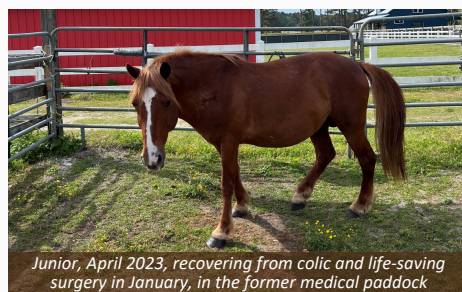
Junior, April 2023, recovering from colic and life-saving surgery in January, in the former medical paddock