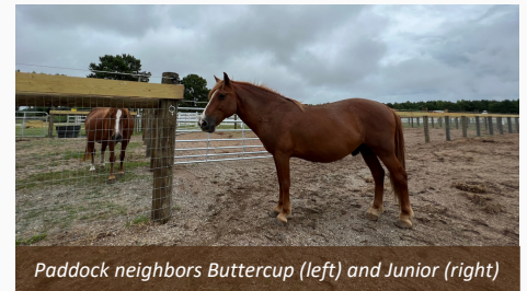
Paddock neighbors Buttercup (left) and Junior (right)

At the beginning of the year we identified areas around our rescue farm that would benefit from new and/or updated fencing. Based on current priorities and needs, we decided to start with building additional paddocks off the back of the barn. This provided us with more space for horse intake, quarantine, and medical care. We now have seven paddocks that are all interconnected but can also be closed off, along with an alley down the middle that will allow us to unload and shift horses without having to handle them. We can now move wild horses much easier and more safely, and have far more flexibility when we must house horses that need specialized care due to medical or behavioral issues (or often both). The fencing consists of wooden posts with wire mesh so that even the wildest horse cannot get through it. This prevents horses from having nose-to-nose contact in quarantine situations, and the fence is tall enough to prevent any of the horses from thinking they could jump over it. While we don't ever want to have to use these areas, because that means we have sick horses and/or horses that have been taken out of the wild, we need to have the infrastructure in place because when we need it, we really need it. Our next significant project will be replacing fencing around the large pastures that house the mares!