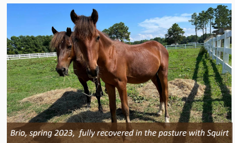
Brio, spring 2023, fully recovered in the pasture with Squirt